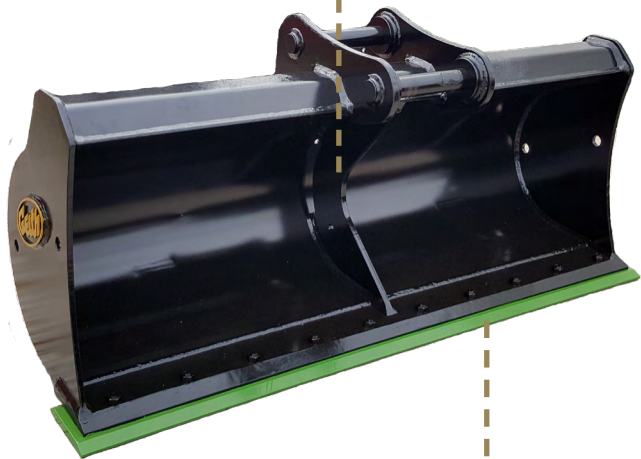
Optional Bolt on Edge Available